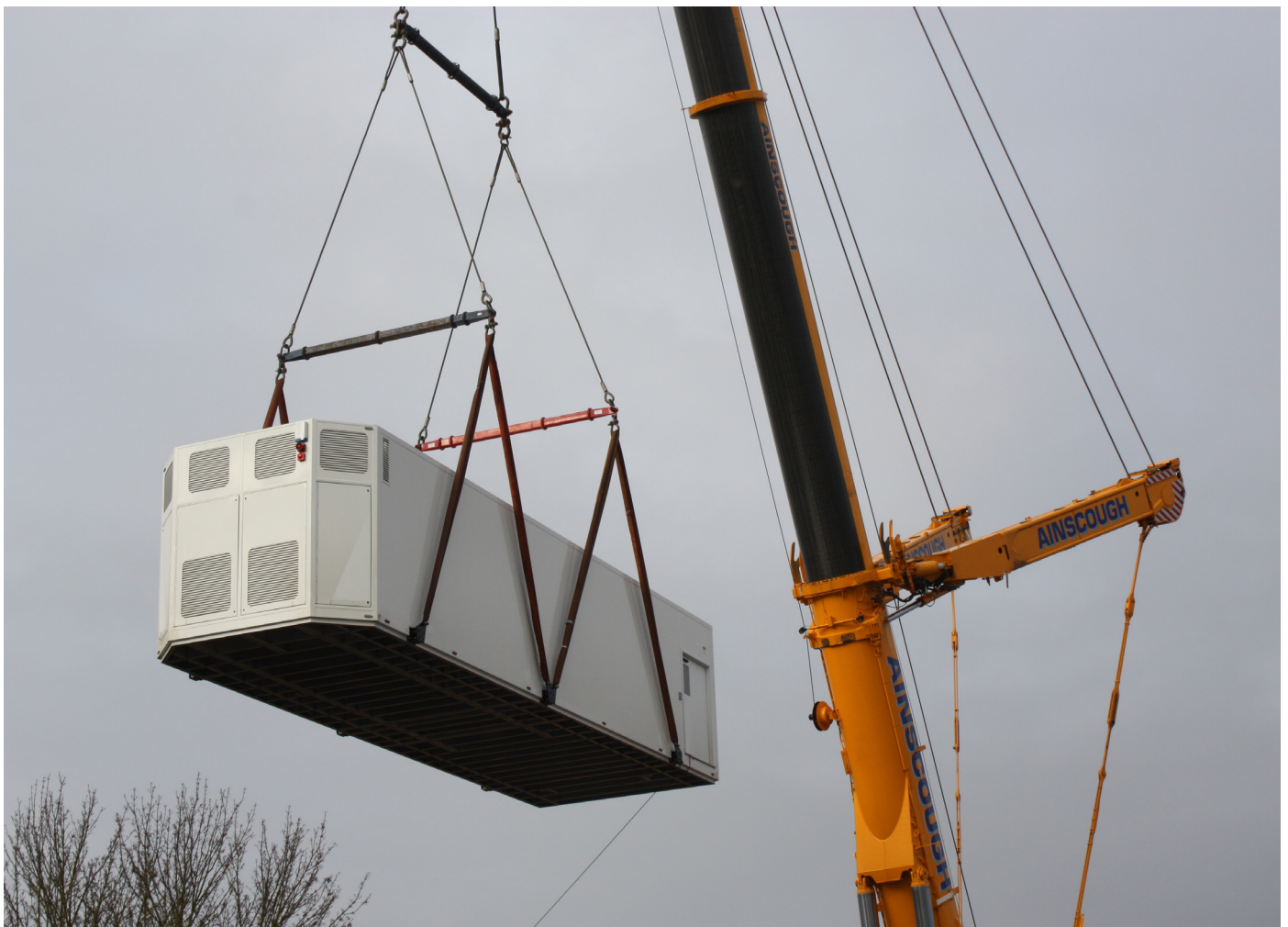
The new scanner is lowered into position from Morrison's car park.

These are exciting times for Stamford Hospital. We have heard of many ideas over recent years for future developments but until recently no evidence that these would be realized. Things have now changed: over the last two months the builders have been working in the Hospital making substantial and very welcome changes to the modern part of the Hospital which amongst other benefits will increase the out patient capacity, transform phlebotomy and greatly enhance the diagnostic imaging department. The arrival of a state of the art MRI scanner last month is reassuring - evidence that the Hospital Trust is firmly committed to the Hospital's future.