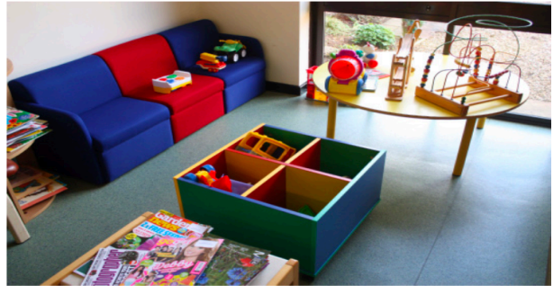
A toy box and activity table to pass the time while waiting.