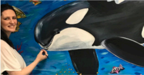
A wall mural specially commissioned for the children's waiting area.