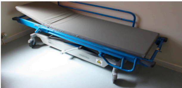
A Bariatric trolley designed for our larger patients.