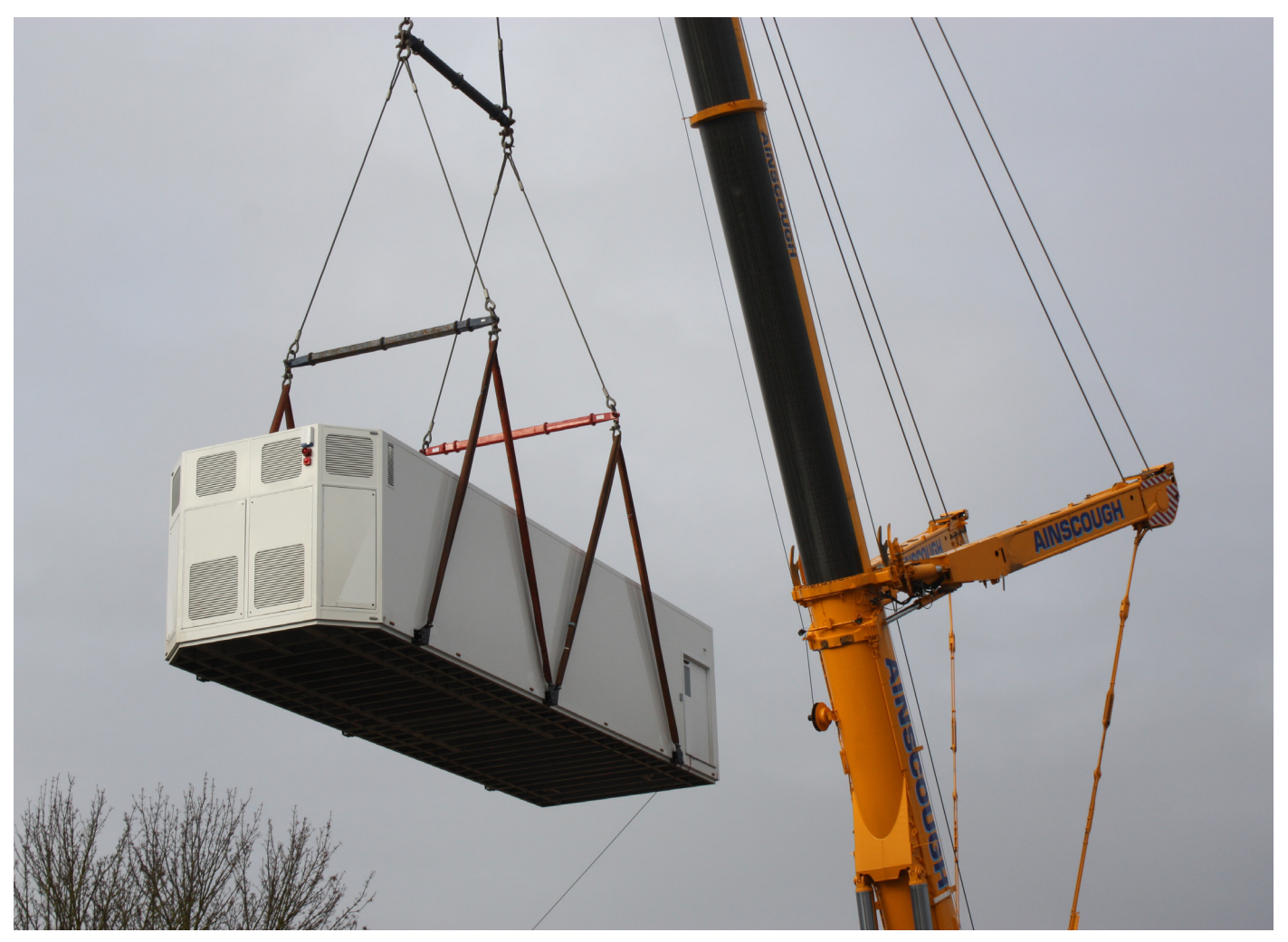
The new scanner is lowered into position from Morrison's car park.

These are exciting times for Stamford Hospital. We have heard of many ideas over recent years for future developments but until recently no evidence that these would be realized. Things have now changed: over the last two months the builders have been working in the Hospital making substantial and very welcome changes to the modern part of the Hospital which amongst other benefits will increase the out patient capacity, transform phlebotomy and greatly enhance the diagnostic imaging department. The arrival of a state of the art MRI scanner last month is reassuring - evidence that the Hospital Trust is firmly committed to the Hospital's future.